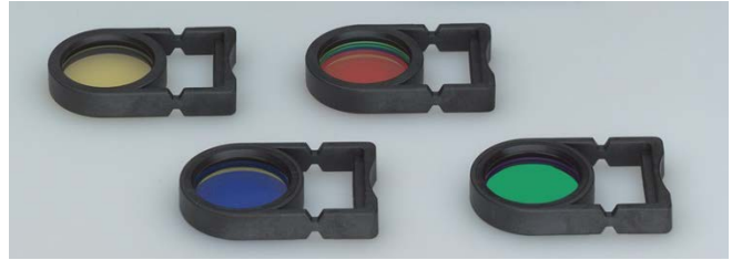
Insert filters for discontinued KL 1500 LCD and KL 1500 compact